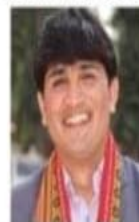
Secretary Alumni Association