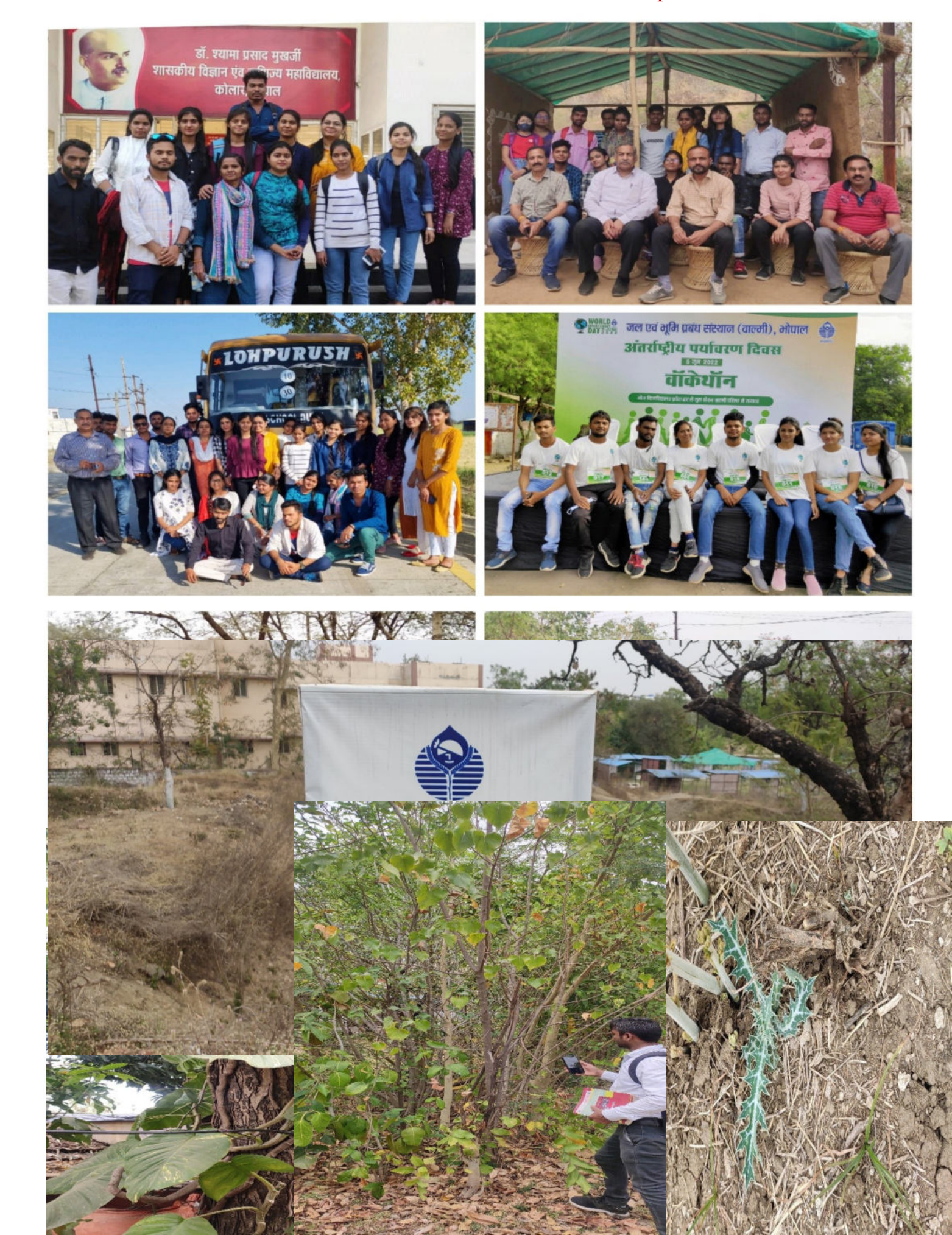
Topic: - The Study of the Medicinal Plant in the Campus of Walmi & Different Techniques of Plantation with reference to Janani Techniques